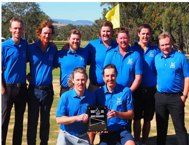
Division 2 winners: Warwick Golf Club